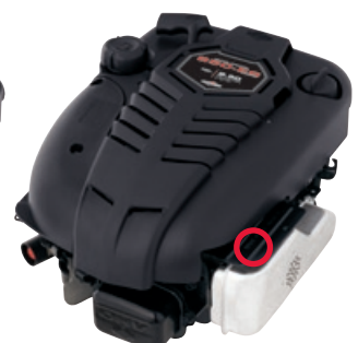
600 Series™, 800 Series™ Quantum®, Intek™